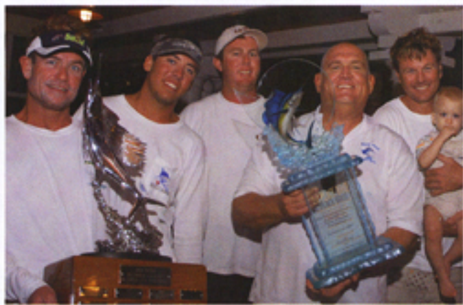
The Reely Tight Team holding the perpetual and first place trophies.

The Jeb Bush is looking to expand into a 2-day format for 2008 which could add more excitement and help their charity cause: The Cystic Fibrosis Foundation.