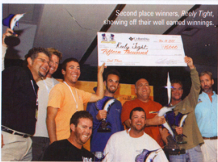
Second place winners, Reely Tight, showing off their well earned winnings.

The winners of the SRE (Simulated Racing Experience) and the Cruzin Cooler races were determined. The evening wound down as fishing teams settled in to prepare for day two of the competition.